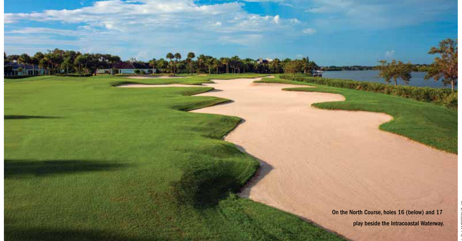
On the North Course, holes 16 (below) and 17 play beside the Intracoastal Waterway.

Though not as long as the North, the South Course calls for careful management and shot-making, its well-defined holes threading through a gauntlet of trees, water, and sand. The front nine is the place to