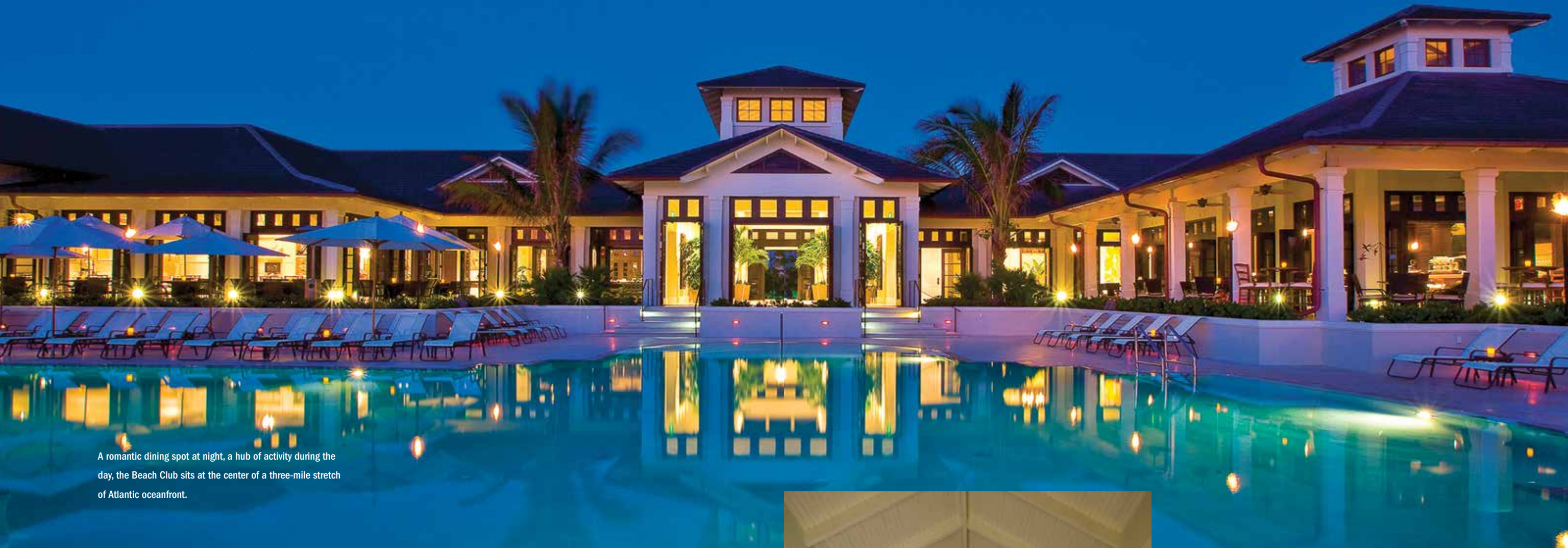
A romantic dining spot at night, a hub of activity during the day, the Beach Club sits at the center of a three-mile stretch of Atlantic oceanfront.

armadillos, tortoises, and box turtles sun themselves on the banks, and ospreys, cranes, and cardinals nest in the trees. It's an environment so pure, one scientist actually planted an endangered species here just to ensure its safety. Apart from the handsome clubhouse at the highest point of the property, there is no structure in sight. This is serenity itself.