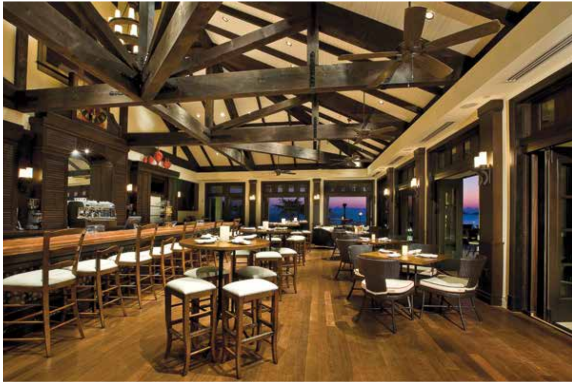
One of the favorite gathering spots is Rafters at the Beach Club. With its beamed ceiling, high-top tables, and expansive bar, it's the perfect place to get together with friends for drinks and dining beside the sea.

those rare chilly evenings. It all wraps gracefully around an illusion pool that seems to flow straight into the sea.