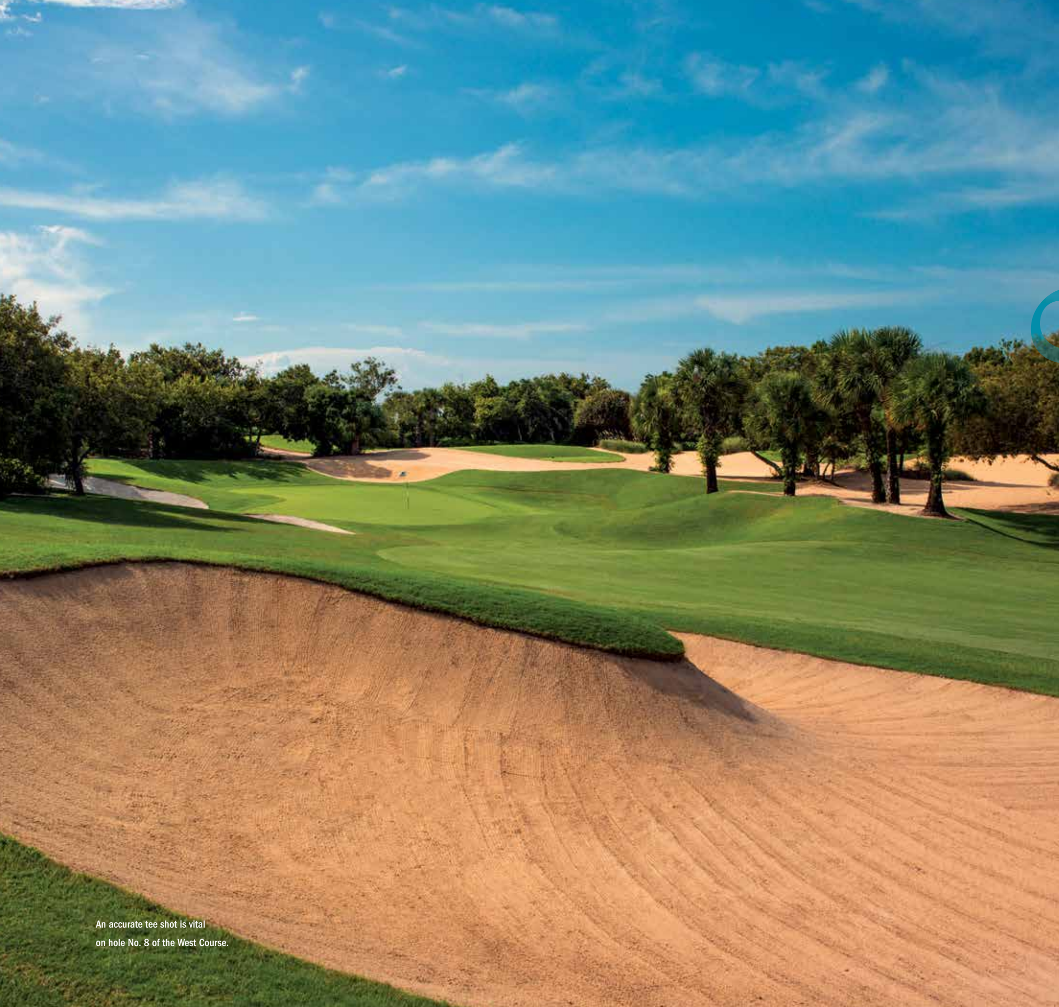
An accurate tee shot is vital on hole No. 8 of the West Course.