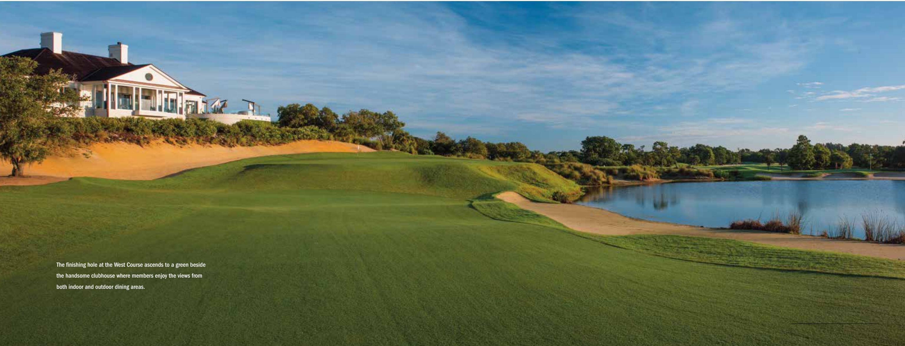
The finishing hole at the West Course ascends to a green beside the handsome clubhouse where members enjoy the views from both indoor and outdoor dining areas.