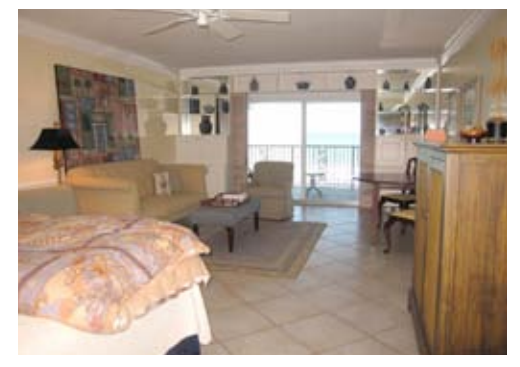
#235 : Updated, desirable oceanfront views, larger unit, custom built-ins, private covered balcony with stunning ocean views. $445,000