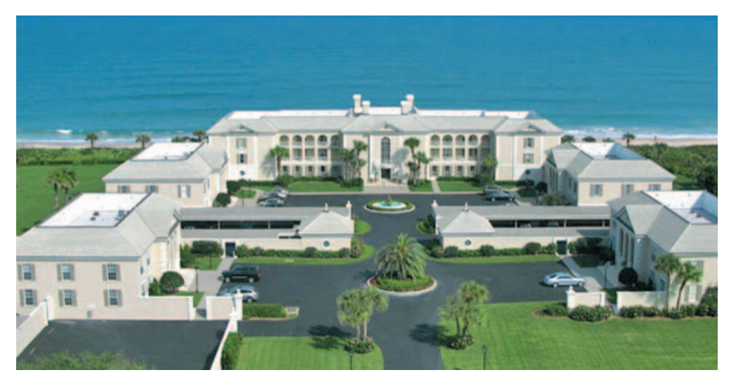
7 : 700 Beach Road #255 : Enjoy stunning ocean views from this charming 2BR/2BA condominium sited beautifully along the Atlantic Ocean. Features include 1520\pm square feet with an expansive living room with dining area and wet bar. The seaside lanai showcases magnificent ocean views. Private pool and beach access. G $550,000