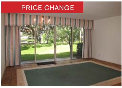
#704 : Charming 2BR/2BA, 1500± SF, overlooks beautiful fairway and lake views, private entrance, western exposure. S $195,000