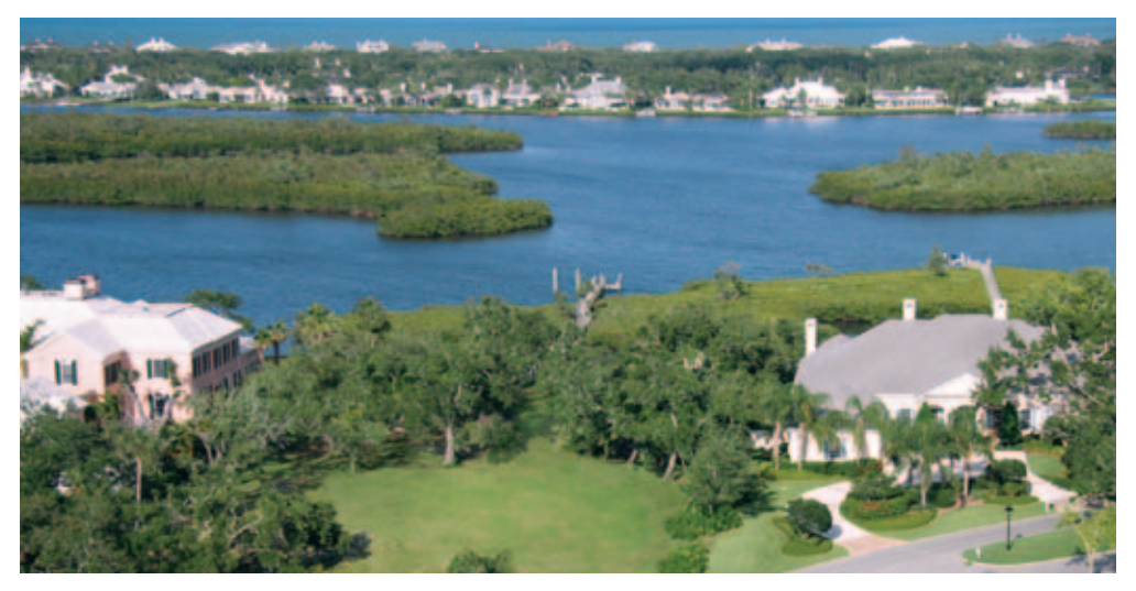
27 : 60 Gem Island Drive : This generous 1.83\pm acre, waterfront homesite is situated along the highly private and desirable eastern side of prestigious Gem Island and features a private boardwalk with boat dock. Lush mangroves, the playful antics of dolphin and manatee, and the meandering ibis and egrets create a relaxed atmosphere for any custom family estate. Enjoy outstanding fishing, boating and kayaking opportunities right in your own backyard. G $3,925,000