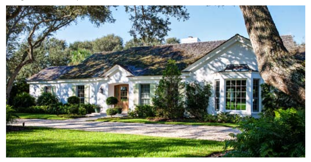
26 : 221 Sea Oak Drive : Impeccably designed, quality construction, custom millwork and sophisticated finishes make this newly built 3BR/3.5BA retreat a rare find. Just a short walk to all Club amenities, this 4800± GSF home is sited on an end lot creating virtually no neighbors. Tuss-beam ceilings and wide plank European White Oak floors add character. Comfortably equipped for family living, features include a pool, spa, outdoor fireplace, dog room for bathing, gracious living spaces, and gourmet island kitchen. $3,250,000