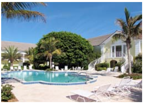
#119 : Desirable southern exposure and oceanside views, beautiful studio with private patio. $230,000