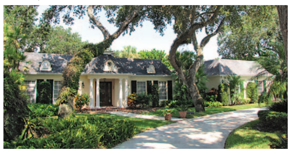
13 : 261 Sabal Palm Lane : Nestled along picturesque fairways of the South Course is this charming 4BR/4BA home located along a quiet cul-de-sac street. Lush tropical landscaping frames this 4084 \pm square foot residence featuring a generous living room with fireplace adjoining the open kitchen and family room with a pecky cypress tray ceiling, master suite with sitting area, high ceilings, pool/spa and golf views. G $1,285,000