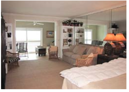
#143 : Beautifully updated, furnished, stunning direct ocean views, larger unit, enclosed lanai. $275,900