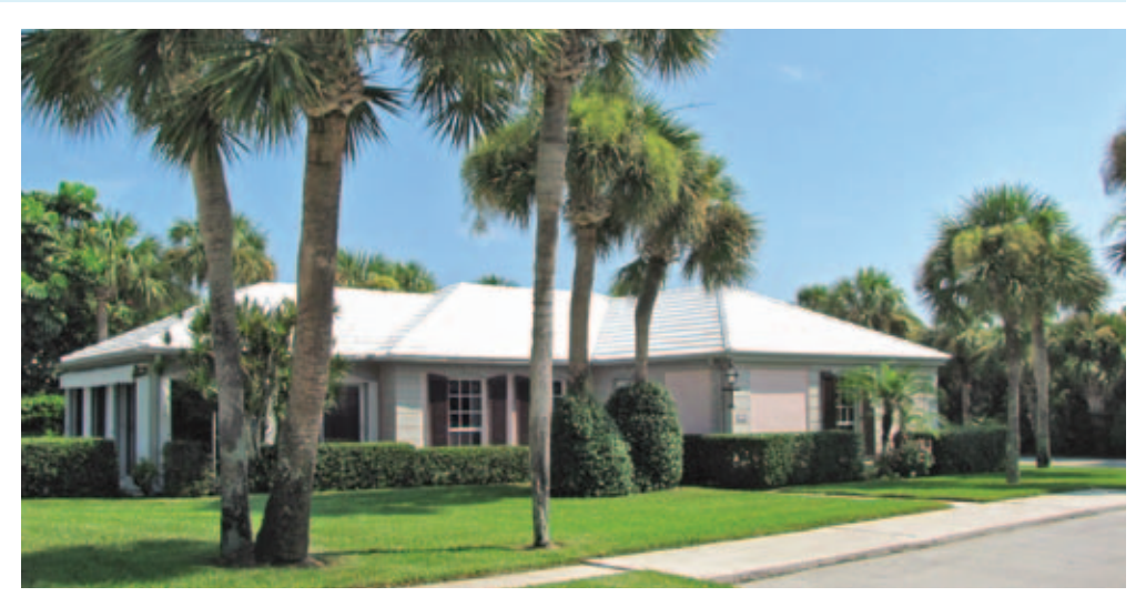
9 : 141 Silver Moss Drive : Nestled along the picturesque fairways of the South Course is this generous 2BR/2BA golf cottage conveniently located a short distance to all Club amenities. Boasting 1900± square feet, features include an expansive lanai with wet bar showcasing gorgeous golf views, large living room with custom built-ins, wood floors, tray ceilings and impact resistant glass windows. Great rental potential! $720,000