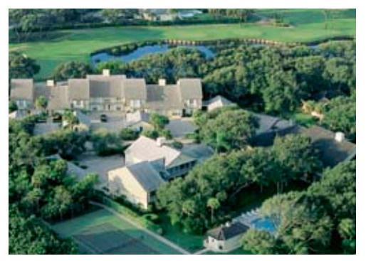
3 : North Village : Two-story townhouses in North Village offering residents private tennis courts, pool, single-car garages and fairway and lake views.