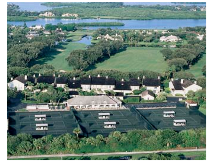
5: Tennis Townhouses: Providing an exceptional lifestyle for the active family, these townhouses are ideally located in the heart of John's Island, within steps to the Tennis Club, Courtside Café, practice range and all Club amenities. Each has a single-car garage.

unique layout, only one of four built, voluminous living areas opening onto private balcony, master suite spans the entire upper level with tree-top views and expansive balconies. $450,000