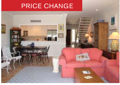
#732 : Renovated 2BR/2BA, desirable southern exposure, 1500\pm SF, pool & tennis views, custom millwork & features. S $315,000