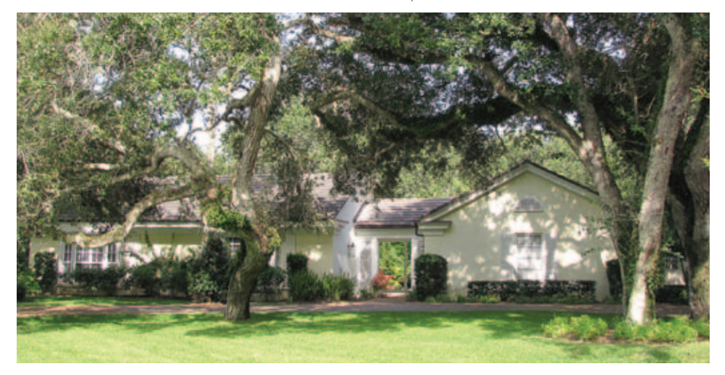
12 : 260 Sabal Palm Lane : Nestled in a tropical setting along a quiet cul-de-sac is this secluded 4BR/4BA beauty. Overlooking multiple fairways, this 3020\pm square foot home enjoys separate living and dining areas, a generous family room with fireplace showcasing the scenic pool, lake and golf views. The carefree and simplistic lifestyle are at a premium in this cottage-style retreat, which includes a detached 1BR/1BA cabana. Conveniently located near the South Gate. S $975,000