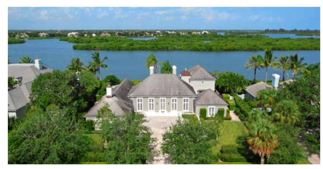
25 : 321 Indian Harbor Road : Poised to capture spectacular views of John's Island Sound is this truly unique 3BR/4BA Gibson original. Overlooking undevelopable island, this 5000± SF home has voluminous ceilings and a generous great room with fireplace showcasing the serene water views and private garden. The island kitchen expands into the vaulted ceiling family room. A dining room, library with fireplace, large guest bedroom with office, upper level master suite and a boat dock complete the picture. G $2,950,000