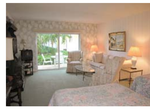
#114 : Furnished, private terrace overlooking tropically landscaped courtyard pool, bright interiors. $129,900