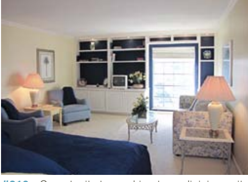
#218 : Opportunity to combine two adjoining units! Furnished, southern exposure, custom built-ins. $115,000