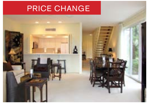
#727 : Meticulous 2BR/2BA end unit, tropical pool and tennis views, 1500± SF, private entrance, two patios and private balcony. $295,000