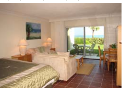
#131 : Furnished, desirable oceanfront views, new shower, large walk-in closet, seaside patio. $285,000