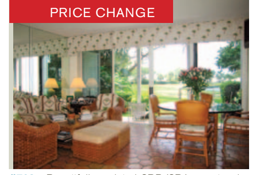
#702 : Beautifully updated 3BR/3BA, spectacular golf and water views, 1900\pm SF, custom built-in bar area, bright interiors, private balcony. G $435,000