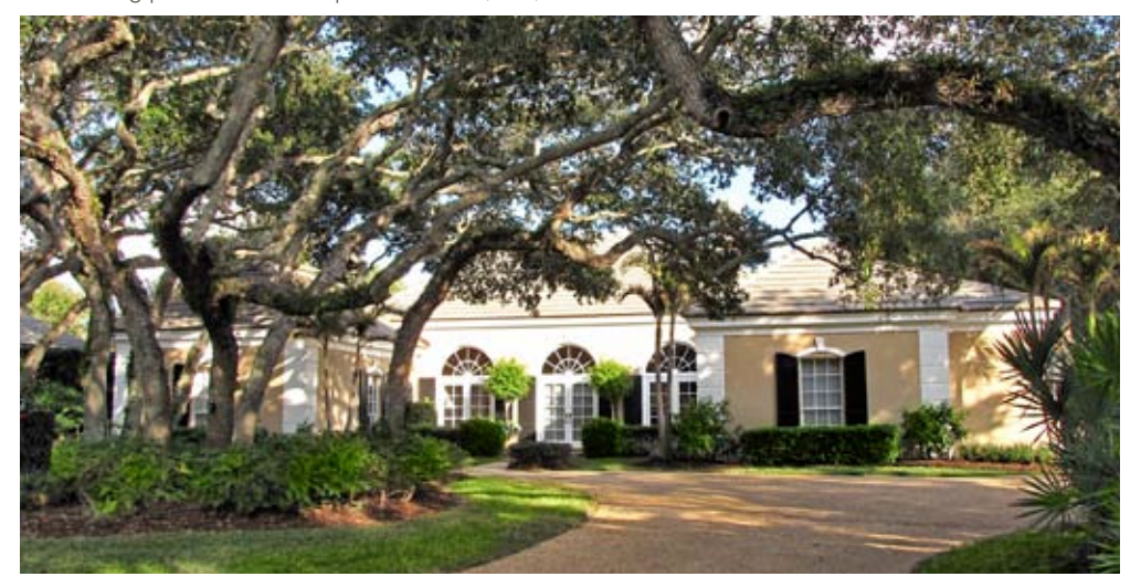
21 : 130 Clarkson Lane : Located just a short walk to all Club amenities in the heart of John's Island is this immaculate 4BR/4.5BA family retreat. Nestled along the South Course offering 4523± SF, it features stunning pool, spa and multiple fairway views, a voluminous great room with fireplace, modern island kitchen adjoining the family room highlighted by a vaulted beamed ceiling and wet bar, separate guest cabana with full bath, luxurious master suite with a custom built office, and ample storage over the garage. $2,150,000