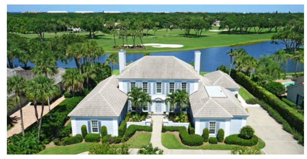
17 : 298 Island Creek Drive : Breathtaking views of the South Course fairways and lakes are enjoyed from this beautiful two-story 5BR/6.5BA residence. Boasting 4654\pm SF, features include a generous living room with fireplace, expansive poolside terrace, spa, bonus family room (or 5th bedroom) with full bath, and a handsome library with wet bar and sitting area. Upstairs, three guest suites open onto a covered loggia showcasing panoramic tree-top views. G $1,900,000