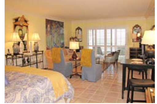
#239 : Exquisitely renovated, desirable oceanfront location, larger unit, custom millwork, built-ins, covered balcony, stunning ocean views. $420,000