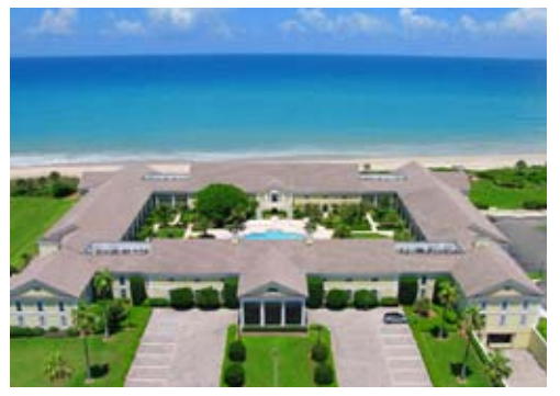
2: Island House: Two-story oceanfront building next to Beach Club, 1BR/1BA, 590± SF. Private courtyard pool & beach access. Rental opportunity!