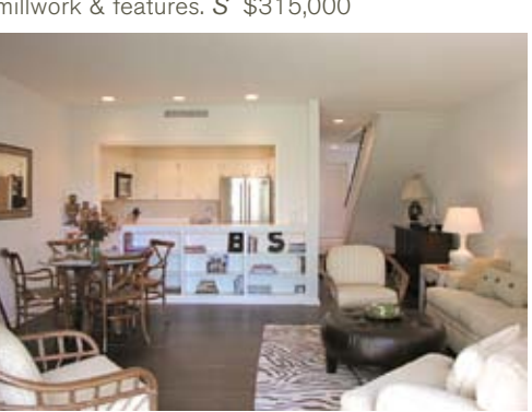
#713 : Exquisitely updated 3BR/3BA, 1900± SF, gorgeous fairway and lake views, bright interiors, custom built-ins, desirable SW exposure. $475,000