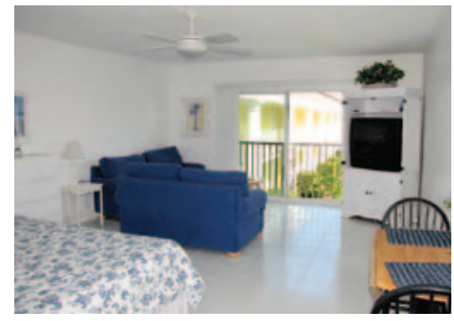
#201 : Beautifully updated, furnished, overlooking tropically landscaped courtyard pool, updated bathroom. $137,500