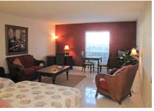
#155 : Beautifully furnished, northwest corner unit, large utility closet with washer/dryer. $110,000