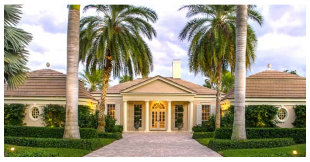
24:280 Palm Way: This exquisite 3BR+Library/5BA retreat is located on a quiet cul-de-sac showcasing spectacular, pool, multiple fairway and lake views. Graceful arches, professionally decorated interiors and a gorgeous poolside loggia echo the tropics. This 5092± SF home is perfectly designed for casual entertaining. The great room and library each enjoy a fireplace. Features include a custom wet bar, luxurious finishes, gourmet kitchen adjoining the family room, and a private master suite. $2,895,000