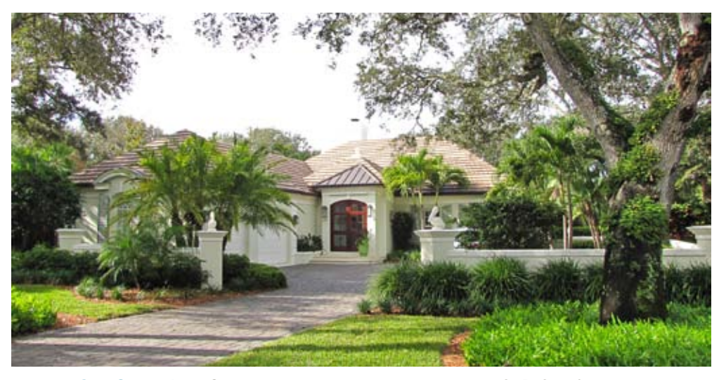
23 : 491 Sea Oak Drive : Sited on an end lot, this recently renovated 3BR/3BA family retreat enjoys continuous, multiple fairway views of the North Course, creating virtually no neighbors. The 3,431± SF home, affords multiple gathering areas with a series of French doors and windows providing ample natural light. The expansive living room opens onto both the family room with custom built-ins, visually separated by a fireplace, and the gourmet eat-in kitchen. Showcases spectacular golf, pool and spa views. $2,740,000