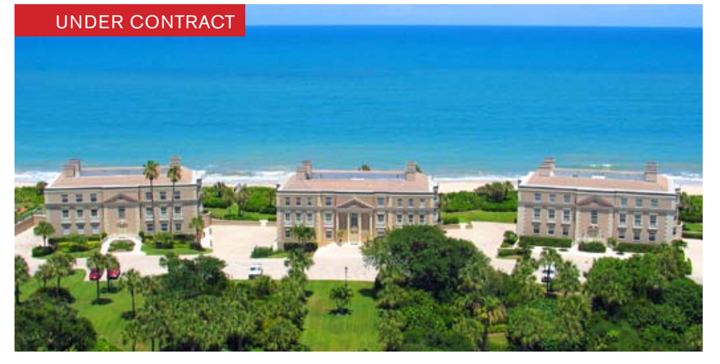
14 : Ocean Road : Ideally located within a short walk to the Beach Club with private beach access. 250 Ocean Road #1C (NEW) – Charming 3BR/3BA end unit, 2600± SF, stunning ocean views throughout, enclosed expansive lanai, wet bar, kitchen adjoining the family room, bright interiors. G $1,375,000 200 Ocean Road #2A (UNDER CONTRACT) – Updated 3BR/3BA end unit, unobstructed southeast ocean views, 2300± SF, covered lanai, wet bar, generous living room and spacious bedrooms. G $1,400,000