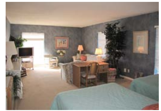
Furnished, unique southwest corner unit, multiple exposures. $115,000