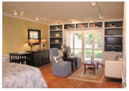
#110 : Exquisitely renovated, detailed millwork and custom built-ins, covered terrace overlooking tropically landscaped courtyard pool. $220,000