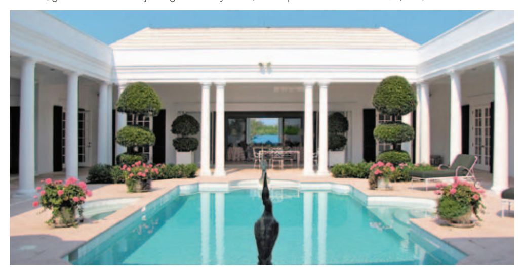
28 : 21 Dove Plum Road : Commanding one of the best riverfront views in John's Island is this magnificent 3BR/4.5BA residence, perfectly designed for indoor/outdoor living. The uniquely designed 5075± SF retreat features a tropical courtyard pool accessible from every room. Features include high ceilings, gourmet island kitchen, stately living room, handsome study, expansive grounds with garden, boat dock with lift and spectacular mile-wide river views. $4,875,000