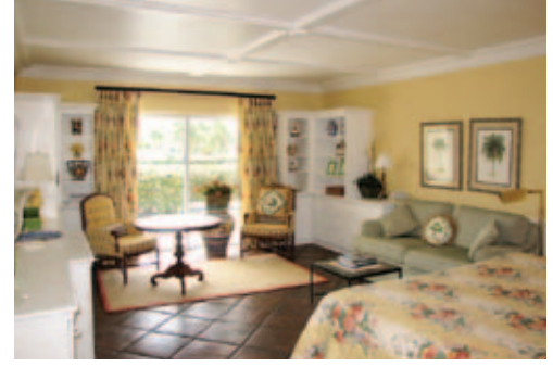
#123 : Beautifully updated, furnished, Frank Lincoln Interiors, custom millwork, desirable southern exposure, covered terrace. $220,000