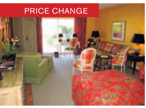
#210 : Updated, furnished, Frank Lincoln interiors,