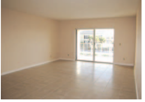
#220 : Updated with detailed finishes, coveted south facing patio overlooking southern oceanside views, new kitchenette & bath. $165,000