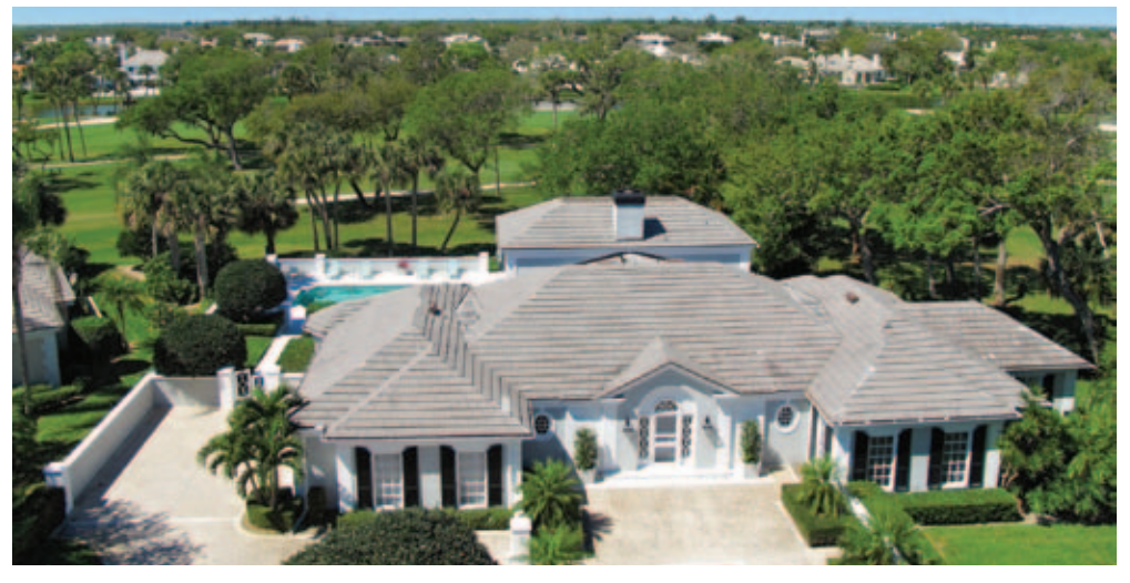
16 : 221 Turtle Way : Positioned at the end of a quiet cul-de-sac is this immaculate 3BR residence offering panoramic vistas of the South Course. Boasting 5,655\pm SF, a double-sided fireplace separates the generous living room from the sunlit lanai where a floating staircase leads to a private guest suite affording spectacular tree-top views. Features include high ceilings, custom finishes and flooring, large master suite, exercise room, and poolside terrace. $1,850,000