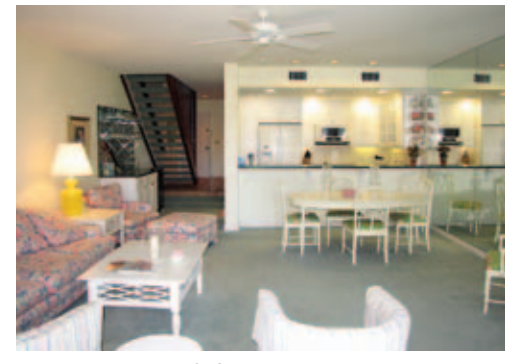
#725 : Updated & furnished, meticulously maintained 3BR/3BA, 1900± SF, pool & tennis views, custom built-in bar & more! $595,000