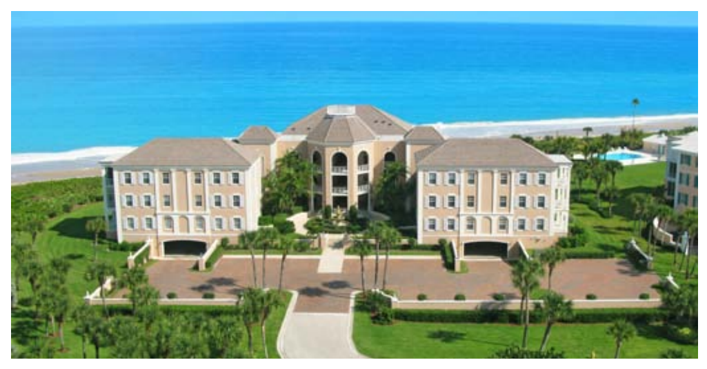
8:750 Beach Road: Set back from the ocean overlooking the tropically landscaped pool and ocean. #201 – Beautiful 2BR/2BA pied-a-terre, 1500± SF, southern ocean views, updated baths. $640,000 #303 (NEW) – Exquisitely furnished & updated 2BR/2BA, 1600± SF, southern ocean views. $795,000 #107 (NEW) – Renovated 3BR/2BA end unit, 1900± SF, gourmet kitchen, southern exposure. G $875,000 #108 (NEW) – Renovated 3BR/2BA end unit, 1900± SF, open kitchen, ocean views. G $895,000