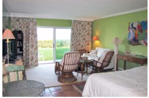
#130 : Updated, furnished, desirable oceanfront location, gorgeous ocean views, breezy seaside patio. $260,000

custom finishes, Habersham furniture, spanish tile floors, private poolside balcony. S $195,000