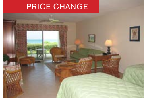
#136 : Furnished, direct ocean views, updated kitchenette, bright interiors, large center unit. $200,000