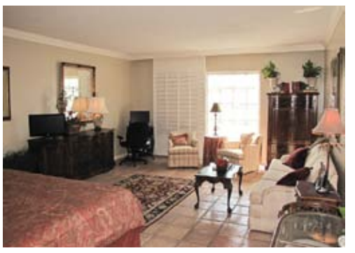
#115 : Opportunity to combine two adjoining units! #116 : Opportunity to combine two adjoining units! Furnished, unique southwest corner unit, $115,000