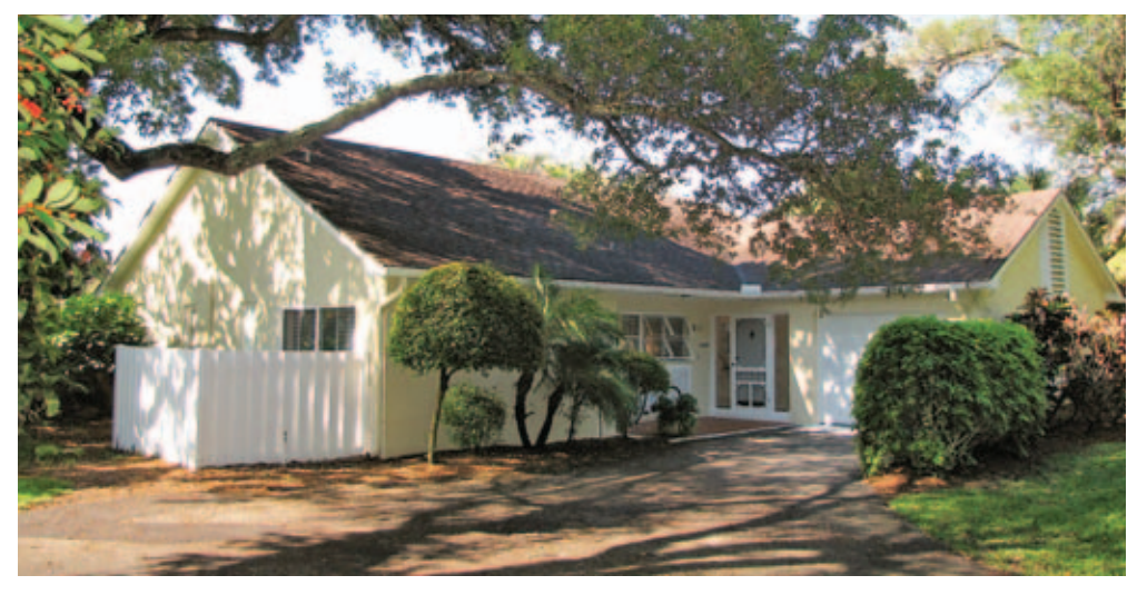
10 : 441 Silver Moss Drive : Ideally located in the quaint setting of South Village is this furnished 3BR/2BA South Village Cottage. Overlooking picturesque lake views, this 2000± square foot home features updated kitchen and baths, generous rooms, expansive terrace, attached 1-car garage and unique southern exposure. Enjoy private access to South Village pool and tennis courts. Great rental potential! $790,000