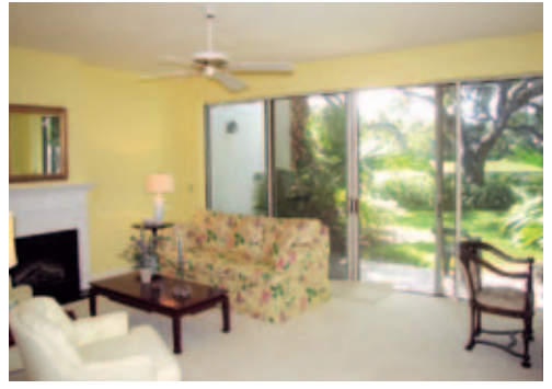
#714 : Furnished 2BR/2BA, 1500± SF, updated kitchen and baths, desirable SW exposure, golf & lake views, bright interiors, private balcony. $300,000