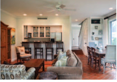
#707 : Remodeled, furnished 3BR/3BA, 1900± SF, coveted end unit, fairway and lake views, custom built-ins, wet bar, gourmet kitchen. $550,000