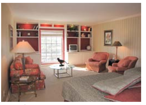
#217 : Opportunity to combine two adjoining units! Furnished, SW corner on 2nd floor, custom built-ins. $115,000