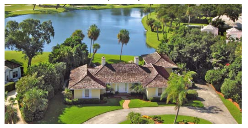
18 : 190 Oleander Way : This architecturally distinguished residence anchors a quiet corner of a picturesque tree-lined, cul-de-sac street with no thru traffic. Overlooking expansive golf and water views, this recently renovated 3BR/3.5BA home includes an attached guest cabana, hardwood floors, beadboard ceilings, custom built-ins, pool and garden courtyard. The generous living room with fireplace opens onto the lanai. Desirable southern exposure and a convenient location complete the picture. G $1,950,000