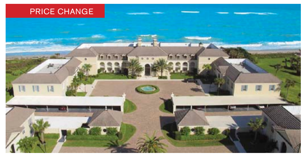
6:500 Beach Road: Set back from the ocean overlooking the tropically landscaped pool and ocean #106 (NEW) – Charming 2BR/2BA, 1520± SF, ocean views, enlcosed lanai with built-ins. $495,000 #115 – Side building, updated 3BR/2BA end unit, 1825± SF, southern exposure. G $625,000 #307 – Updated 2BR/2BA, 1590± SF, ocean views, marble floors, enclosed lanai. $625,000 #203 (PRICE CHANGE) – Side building, 3BR/2BA end unit, 1825± SF, updated kitchen. G $749,000