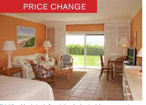
#142 : Updated, furnished, desirable ocean views, luxurious marble bathroom, kitchen with dishwasher, seaside patio. $265,000

custom finishes, Habersham furniture, spanish tile floors, private poolside balcony. S $195,000