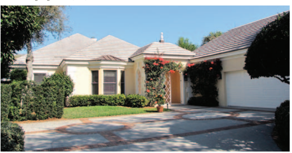
19 : 211 Sundial Court : Within the quaint seaside setting of Oceanside Village, shaded by magnificent oaks and located just steps to the beach is this beautiful 4BR/4.5BA courtyard home overlooking an exquisite, tropically landscaped pool and fountain. This private 4243\pm SF sanctuary features an open living room with fireplace, spacious dining area, lanai with wet bar, gourmet kitchen with breakfast nook, luxurious master bath, den/guest bedroom, separate guest cabana and 2-car garage. G $1,950,000