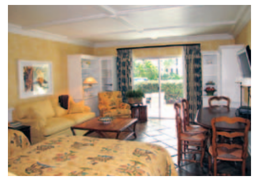
#124 : Beautifully updated, furnished, Frank Lincoln Interiors, custom millwork, desirable southern exposure, covered terrace. $220,000