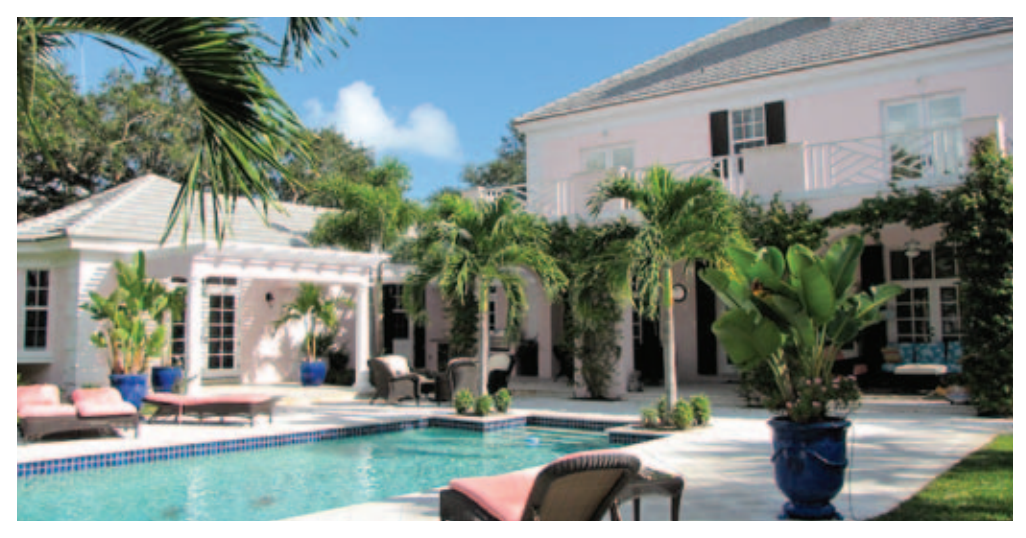
22 : 561 Sea Oak Drive : This remarkable 5BR/4.5BA two-story residence is a must-see! Soaring ceilings, new fixtures, custom millwork and wood floors grace the professionally decorated interiors. The sunlit veranda perfectly frames the saltwater pool and fairway views. Boasting 5000± SF, features include an expansive kitchen adjoining the family room, billiards room, newly added main level master suite, upper level guest rooms and expansive terraces. $2,475,000