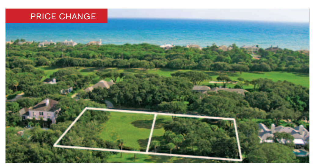
11 : 541 & 551 Sea Oak Drive : The quiet, peaceful and private environment found here is unsurpassed. Beautifully sited along the 4th fairway of the North course are two .45± acre homesites, offered separately. Enjoy serene sunsets and warm island breezes from these spectacular homesites, surrounded by matchless natural beauty, specimen oaks and golf views. These are just a few of the golf course lots remaining. $920,000 each