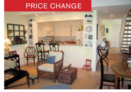
#717 : Beautiful 2BR/2BA end unit, northern exposure,1500± SF, two patios, private entrance, pool views, bright interiors. G $295,000