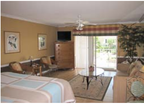
#225 : Updated, furnished, corner unit, private balcony overlooking oceanside views, desirable southeast exposure. $225,000