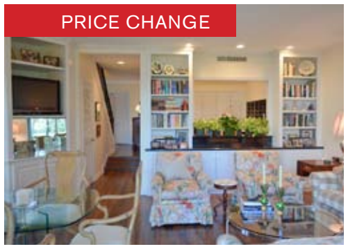
#706 : Exceptionally renovated 3BR/3BA end unit, private entrance, 1900± SF, gorgeous lake & fairway views, wood floors, built-ins. $450,000