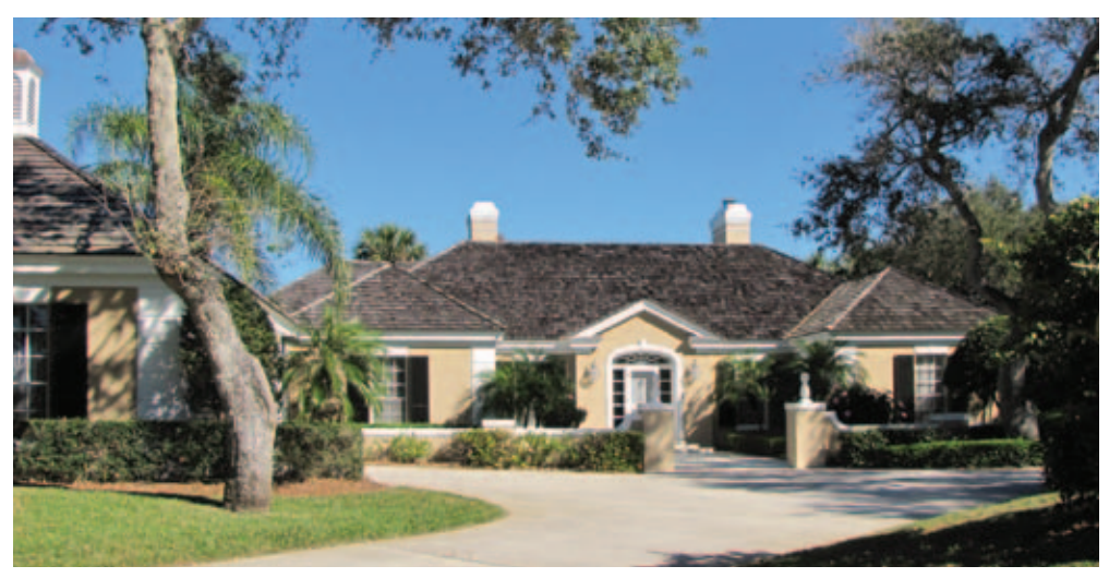
15 : 470 Sea Oak Drive : Charming 4BR/4BA home with continuous vistas across multiple fairways of the north course from both sides of the property due to its unique location. Offering 4333\pm SF, features include a generous great room with fireplace, dining area and wet bar, island kitchen that opens onto the family room and breakfast room, generous master suite, three guest bedrooms with full baths, private pool and two-car garage. G $1,625,000