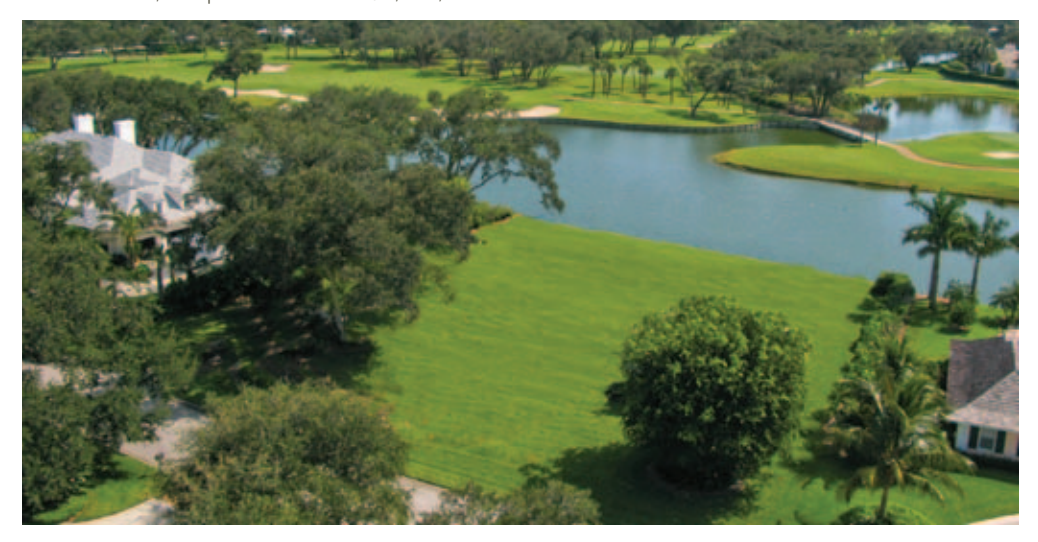
20 : 270 John's Island Drive : A highly-desired location coupled with exquisite, panoramic golf and water views of the South Course make this .59\pm acre homesite an ideal setting to build a custom home. Perfect for the active family, this lot-and-a-half homesite is within steps of all Club facilities and nestled along the 18th fairway with one of the best golf and water views available in John's Island with southern exposure. G $2,050,000