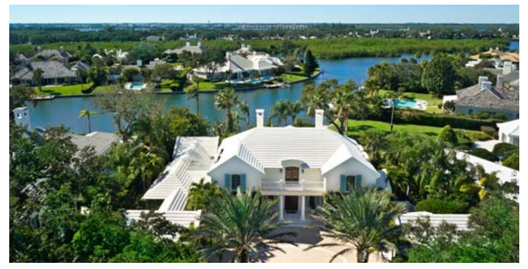
29 : 401 Sabal Palm Lane : Newly constructed, this 4BR/6BA soundfront family retreat is nested along a protected cove of John's Island Sound. Boasting 6,510\pm SF, it affords breathtaking pool and water views. Custom millwork, beamed ceilings and hardwood floors add warmth and character. The dramatic double-height living room with fireplace and wet bar, study, office, luxurious master suite, gourmet kitchen adjoining the family room, upper level guest suites, dock and two, single-car garages add distinction. G $4,875,000